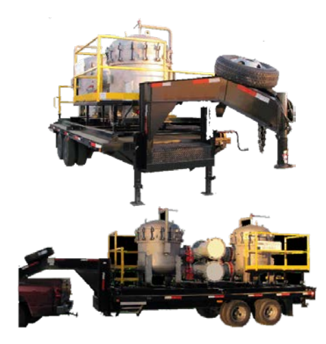
BVTM48-1 High-Flow Trailer Mounted Bag Filtration Systems