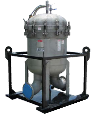
B8-7 Multi Round Filter Vessel (3/4/6/8/9/12/18/24 Bag Vessels)