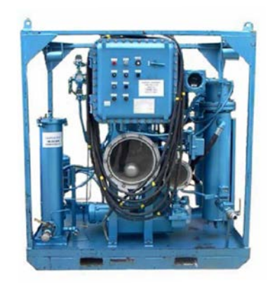
VDOPS-20-N7-1 Vacuum Dehydrators (5/10/15/20/30 gpm units)