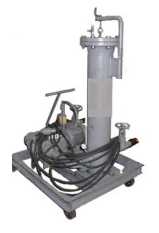
POF30-1 Portable Oil Filter with Pump