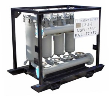
BV4-1 Multi Vessel Systems (2/3/4/5/8 Vessel Systems)