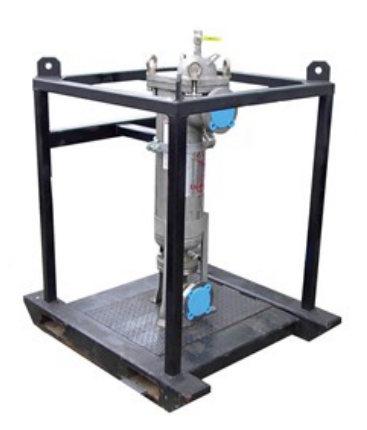
B1-3 Single Bag Filter Vessel