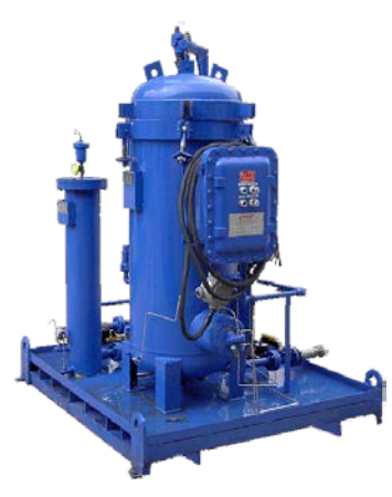
TT-30-N7-1 Turbo-Toc System